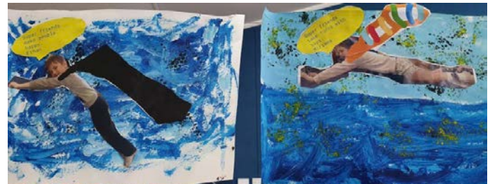
Values Super Heroes - Rm 1