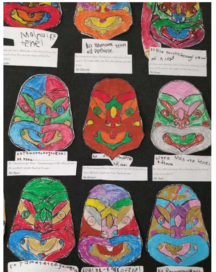
Atua art - Akomanga 14

This week is Te Wiki o Te Reo Māori. Central is very proud to have have Māori Immersion learning (Te Arawaru) within our school, which supports the kaupapa of the whole school where te reo is highly valued and regularly interspersed into daily korero. This week, staff have been further challenged to extend their korero when ordering coffee! Here are some phrases you can try: "He kawhe koa?" - Can I have a coffee please? "He mōwai koa?" - Can I have a flat white please? Other phrases that we have been practising are: "E pēhea ana tō rā?" How's your day going? "Kei te pehea koe?" How are you?