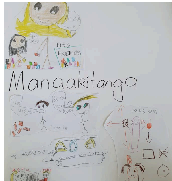
What the Value Manaakitanga means to Room 1