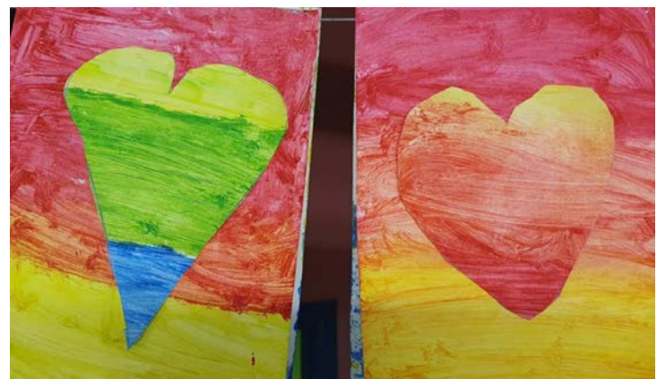
Colour change art - Pod 8

Tonight are our two school discos, with the theme of Matariki. The Junior Disco (Years 0 - 3) will be held from 5.30pm to 6.15pm. The Senior Disco will be held from 6.30pm - 7.15pm. The discos are ONLY for Central Normal School children and children will only be allowed to go to the disco for their age group, that is, a Year 6 child cannot go to the Year 0 - Year 3 disco. Entry is $2 and there will be food and novelty items available for purchase. All funds raised from the disco will go towards the new fitness/pump track at our school.