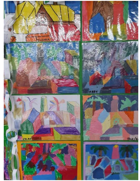
Geometric visual art - Hub 12