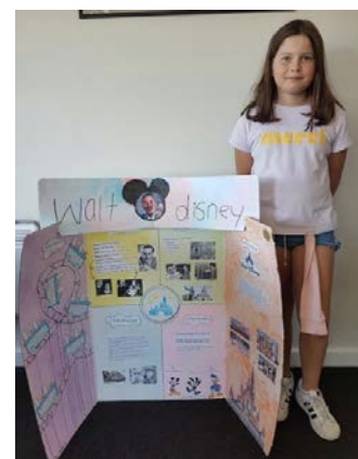
Home Learning Challenge - Hub 12