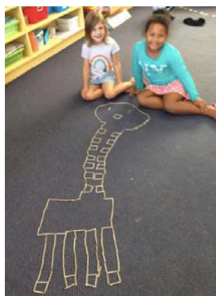
Maths Rich Tasks - Room 1