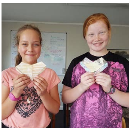
Paper folding - Hub 12