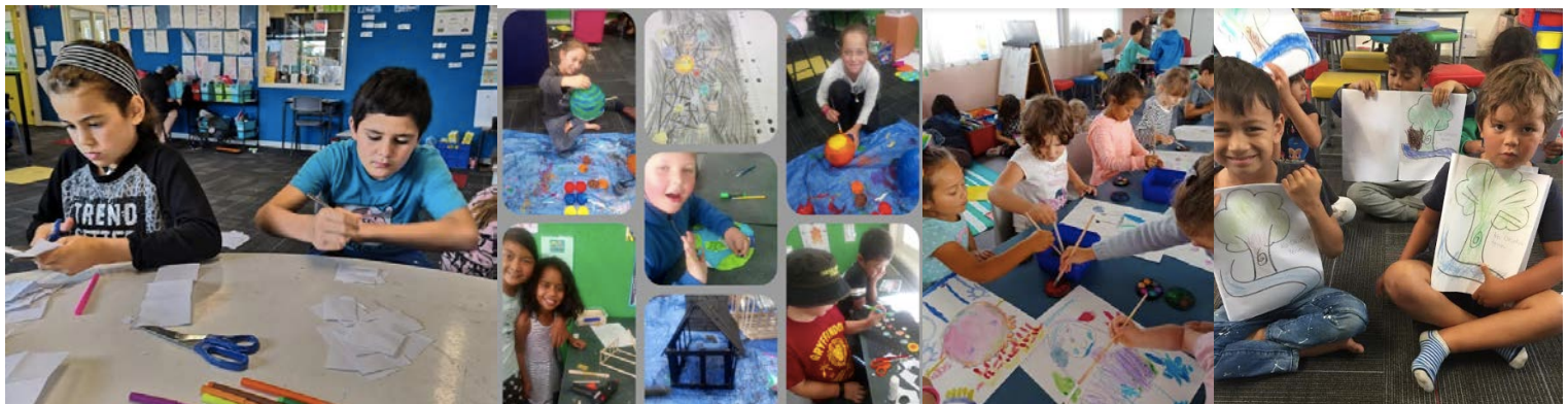
Place Value learning: Hub 9