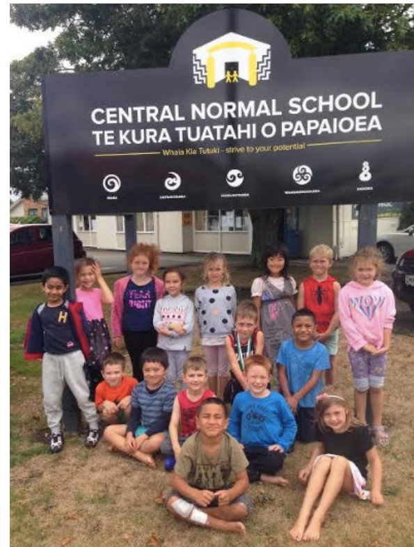
Room 1 children with our new sign

A reminder that we are finishing early on Friday 22 March at 12.50pm, to allow our teachers to attend their paid union meeting. A notice was sent home with all children asking if they would be collected at this time or remaining at school. Please Note: there will only be limited supervision available at school. If you haven't already done so, PLEASE send this panui back to us (a copy can be found on Facebook). We will not allow any child to walk home unsupervised at this time.