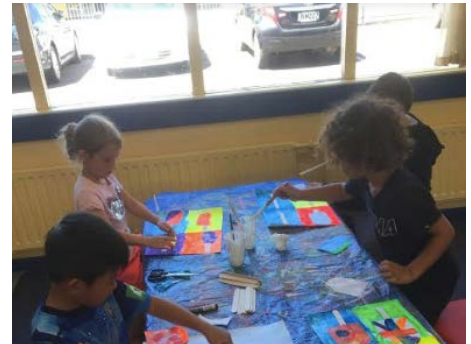
Room 2 painting pop art ice-blocks