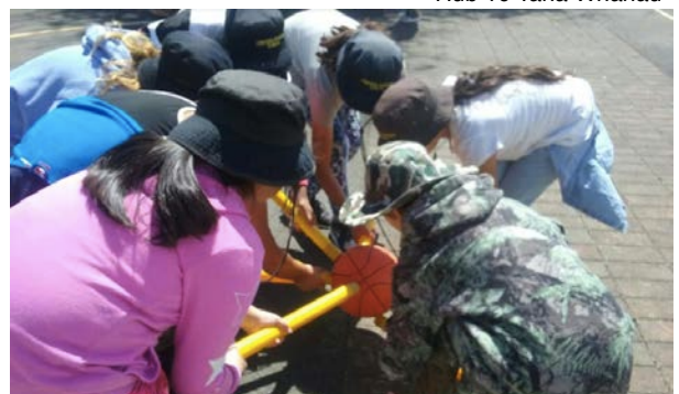
Hub 10 Taha Whānau