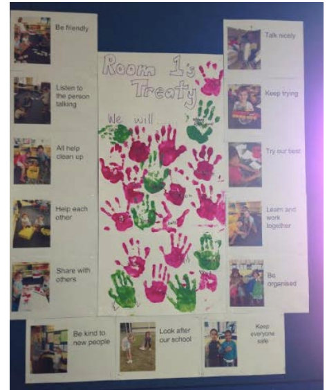
Room 1 Class Treaty