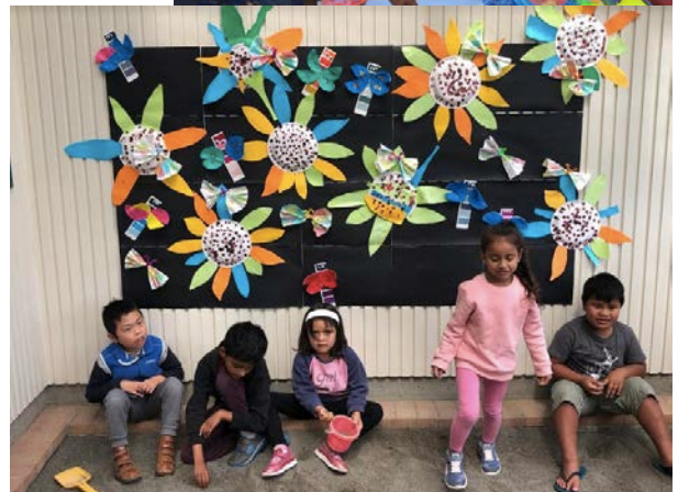
Some of our ORS children with their art mural